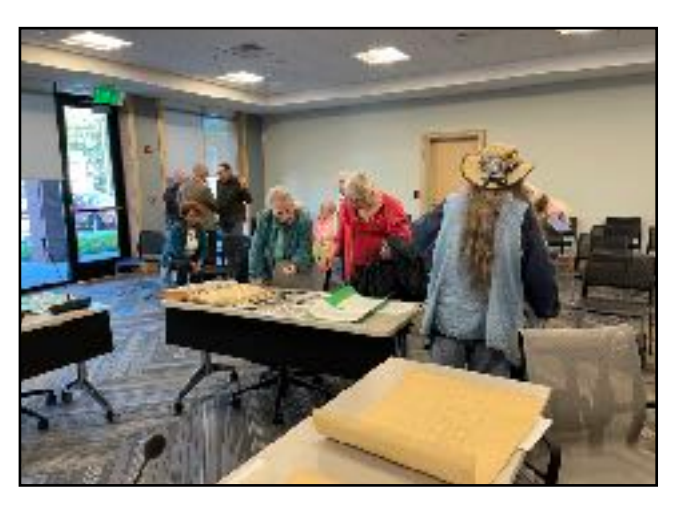
Attendees at the September 24 presentation view display of documents and maps.